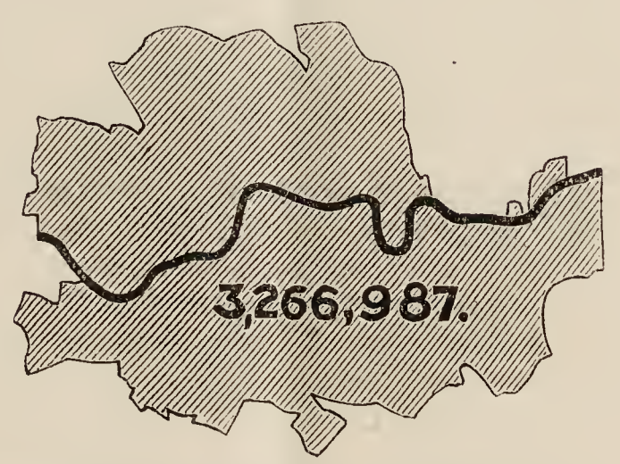
In-Patients, 58,671; Out Patients, 830,519. (Dr. John Chapman, "Medical Charity," p. 6.) POPULATION IN 1891.

Its growth has gone on at a prodigious rate since the beginning of this century, and notably so during the past twenty years. A mere statement of the figures conveys but a faint impression of its magnitude, but I am enabled to reproduce two maps of the county of London, which were POPULATION IN 1871.